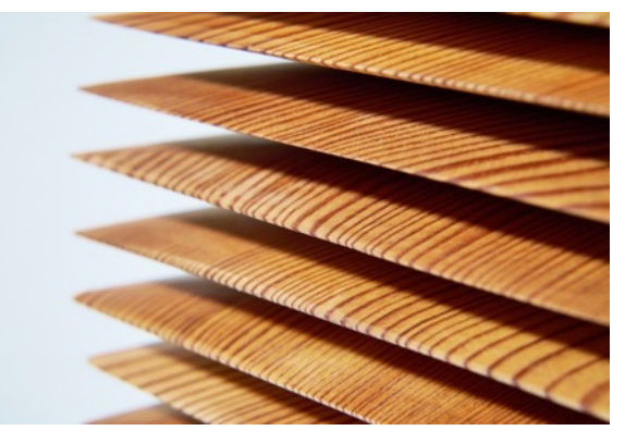
the layer of self / H39×18.5×15cm *part Japanese larch / 2020