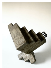
GENSEKI- abstraction - / ceramic / h38×w43×d30cm / 2020

*If there are anything you need further information, please feel free to contact me ( masaru_nishiyama@hartbeat.co.jp ).