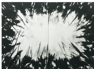
Theoria 017-04 / Panel, Paper (Stencil Aquatint) / h65×w90×d2cm / ed.5 / 2017