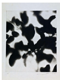
Theoria 019-01 / Japanese paper, stencil collagraph / h28×w23cm / ed.5 / 2019