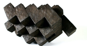
GENSEKI- wave - / ceramic / h25×w45×d26cm / 2020