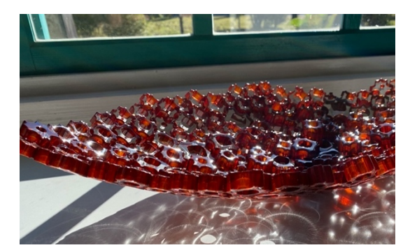
KAGUYA "Sho" / Blown Glass, Fusing / h54\times w28\times d11cm /\ 2020\ ^*part\ \ (relief\ on\ the\ wall)