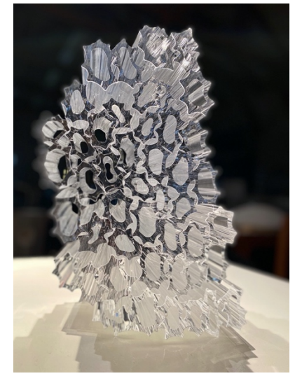
Forest I / Blown Glass, Fusing / h33×w20×d16cm / 2020