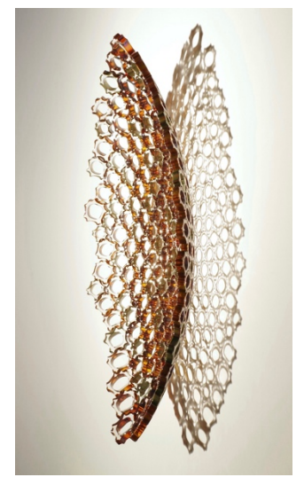
KAGUYA "Sho" / Blown Glass, Fusing / h53×w33×d10cm / 2020