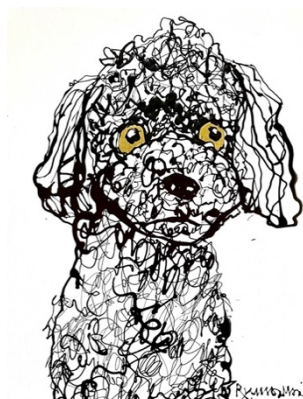
Toy Poodle / 53.0×41.0cm / enamel & acrylic on canvas / 2021