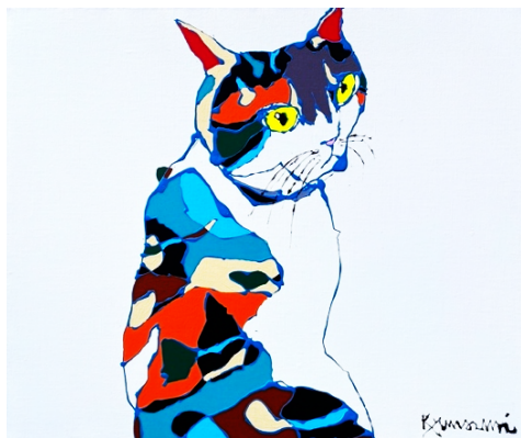
Cat / 60.6×72.7cm / medium & acrylic on canvas / 2021

Collaboration : “Rydeen Beer ” Label (Sarukura Mt. Craft Beer Brewery • Hakkai Brewery / Niigata)