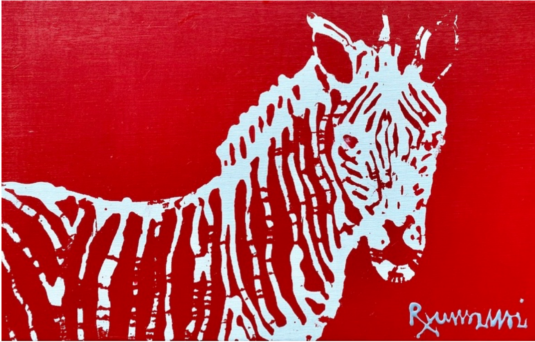
Zebra h33.3×w53.0cm / masking medium & acrylic on canvas / 2021