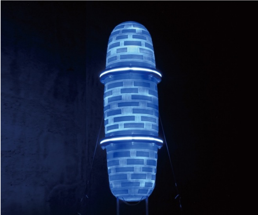
KAGAYAKI - COCOON

h46×16×16 cm / Mixed Media, Shigaraki Translucent Clay, Blue LED Light