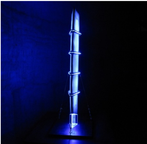
KAGAYAKI - ZAN / h88×w17×d10cm / Mixed Media, Shigaraki Translucent Clay, Blue LED Light